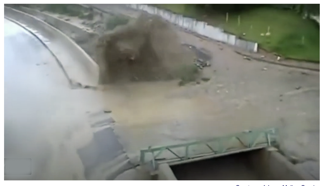
Fig. 4 Roll waves on the Huayñajahuira river channel, La Paz, Bolivia, on December 11, 2021.