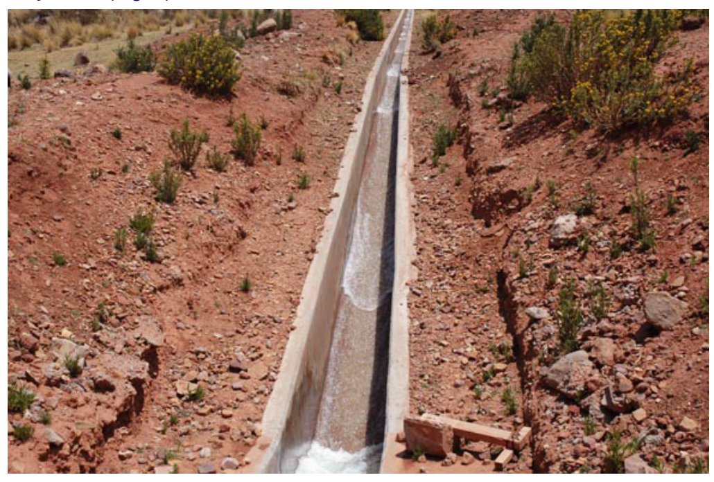
Fig. 3 A train of roll waves traveling in a steep irrigation canal, Cabana-Mañazo, Puno, Peru.

In conclusion, open-channel flow waves will be subject to attenuation when the Vedernikov number is V < 1. In steep lined channels, when the Vedernikov number is poised to exceed 1, the attenuation factor will switch from positive to negative, setting the stage for wave amplification. This flow condition may eventually lead to the development of roll waves. We note that, depending on the discharge level, a roll wave event may or may not represent a risk of bodily harm to unsuspecting persons that are close or next to the channel when the event is occurring.